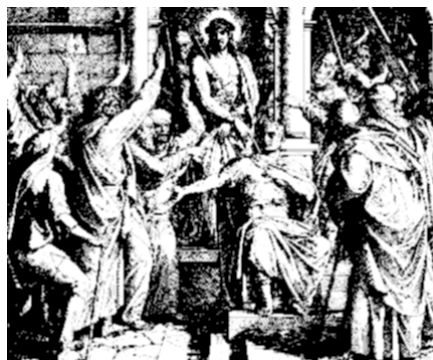
Before Pontius Pilate

The Passover lamb was to have no visible defect or blemish on it, flawless and no stain of imperfection found. This requirement for the lamb obviously points to the fact that as God's final Lamb Jesus was sinless and perfect in his humanity and moral character. The lamb without mark or blemish represents the spotless character and impeccability of Jesus the Messiah. The disciples lived with Jesus for over three years and never once did they see Him sin or commit wrong in all that time. No wonder the apostle Peter identified Jesus as " the Lamb without blemish and without spot " in 1 Peter 1:19. Notice in this passage Peter makes an allusion to the Passover lamb in Exodus 12:5 and sees its fulfillment in the perfect character and conduct of Messiah Jesus. John, one of the closest apostles of Jesus, testified of Him, " In Him is no sin " (1 John 3:5). On this same theme the writer of Hebrews adds that Jesus was " holy, harmless, undefiled, and separate from sinners " (Hebrews 7:26). Not only did Jesus' close friends and followers affirm His personal impeccability as God's sacrificial lamb for man, but also even His fiercest foes and those