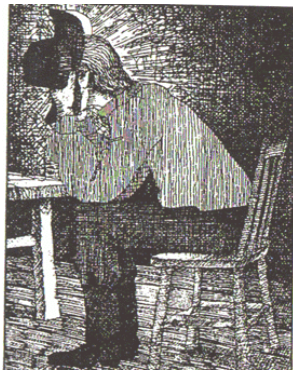
Joseph Smith - Mormonism

God brings His divine curse down on all those who blasphemously presume to fabricate another Gospel of their own liking (see Galatians 1:8-9). All throughout the history of the Church, from the days of the Apostles to the present, there have been numerous tares sown within the Church that have attempted to pervert the Gospel of Christ. In