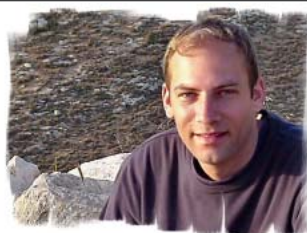
Will King Guest Author

hosted by the quartet, to determine "...final, permanent status resolution in 2005, including borders, Jerusalem, refugees, settlements; and, to support progress toward a comprehensive Middle East settlement between Israel and Lebanon and Israel and Syria, to be achieved as soon as possible."