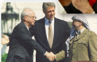
Rabin with Clinton and Arafat