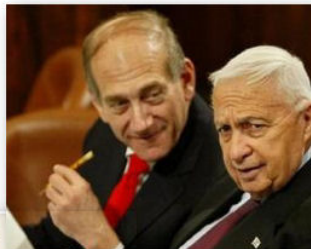
Olmert and Sharon

So then, we have an Acting Prime Minister in Israel who speaks just like Mahmoud Abbas. Moreover, he is an Abbas who now legally presides over the people of Israel. What greater enemy could they have? Perhaps Ehud could give up his land – the seat of Prime Minister – to Abbas, as a self-sacrificial example for the rest of Israel; it probably wouldn't involve regime change! Let us hope and pray that, one way or another, Abbas – um... I mean, Acting Prime Minister Ehud Olmert – does not follow through on his threats. ✧