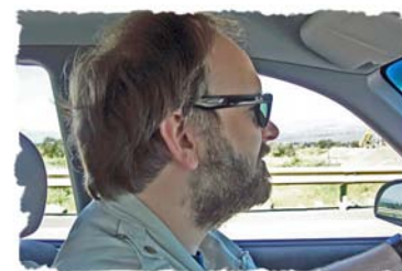
Driving to Mount Hermon