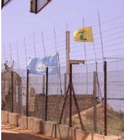
The UN and Hezbollah flags fly side by side at UN observer post in Lebanon