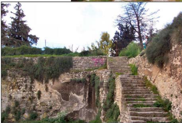
The Pool of David