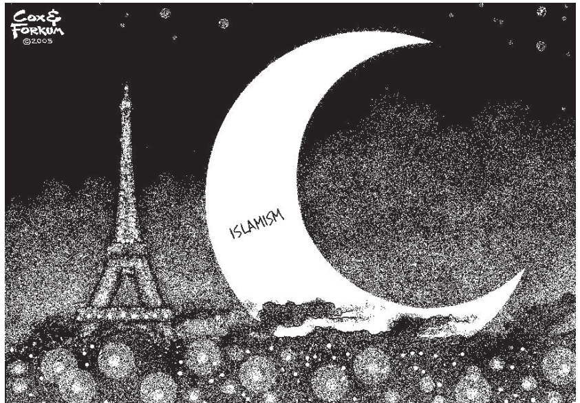
BAD MOON RISING

Sliced salami may be a lunchmeat or delicatessen, but "slicing salami" can be a tactic! ✠