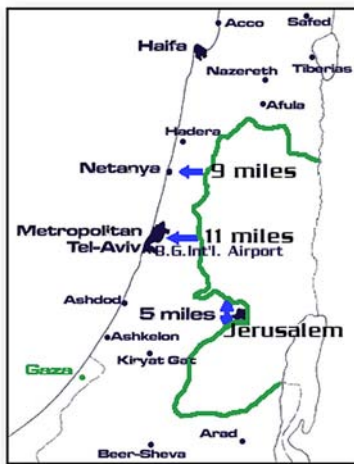
The "green line," showing its proximity to Israel's populated centers and to Ben Gurion International Airport, as well as controlling the high ground separating Judea and Samaria from the coastal plain of Israel.