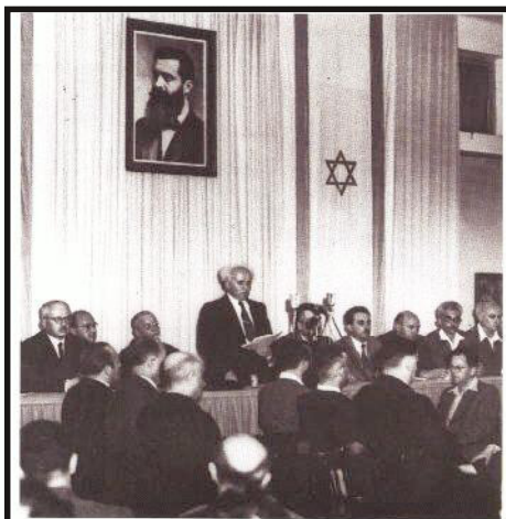
Israel's first Prime Minister, David Ben Gurion, reading Israel's Declaration of Independence, 14 May 1948. (The photo on the wall is of Theodor Herzl, the founder of "Zionism.")

Israel's Declaration of Independence has the following passage: "We extend our hand to all neighboring states and their peoples in an offer of peace and good neighborliness, and appeal to them to establish bonds of cooperation and mutual help with the sovereign Jewish people settled in its own land. The State of Israel is prepared to do its share in a common effort for the advancement of the entire Middle East."