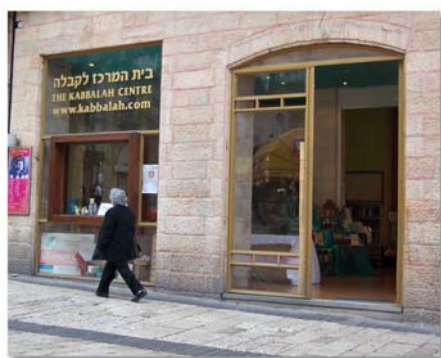
The Kabbalah Centre on Ben Yehudah St.