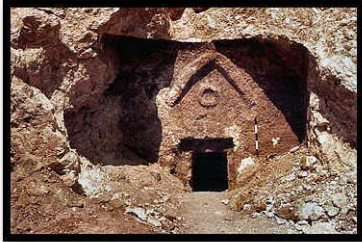
The supposed "Lost Tomb of Jesus"

she told us in her broken English "he cares nothing for the people here. He is for cinema. He brings crews digging and tearing up everywhere." She told us "he is a liar". We learned that it was her children who found this ossuary 20 some years ago while they were playing. This was one of the few historical elements of the film that was portrayed correctly. I marveled at this divine appointment with the one person who could accurately tell us of this saga from the beginning.