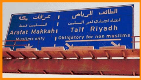
Speaking of Apartheid, check-out this Saudi road sign

monthly payments for each child they have) essentially meaning that Israel is subsidizing Arab births — does that sound apartheid?!