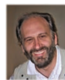
by Todd Baker

Stories from our Spring 2010 Gospel Outreach to Israel - Part 1