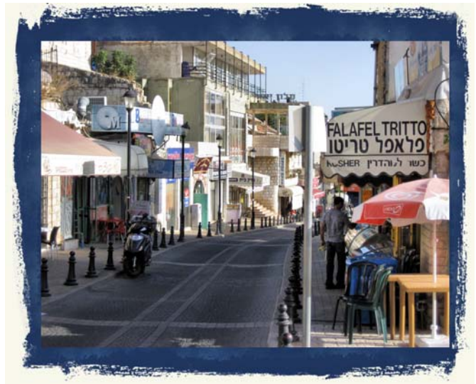
A narrow road in the old city section of Zefat