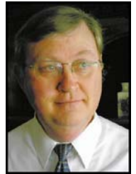
by Mark Carney

and to think of people below them as if they really were fellow-passengers to the grave, and not another race of creatures bound on other journeys. And therefore, uncle, though it has never put a scrap of gold or silver in my pocket, I believe that it has done me good, and will do me good; and I say, God bless it!"