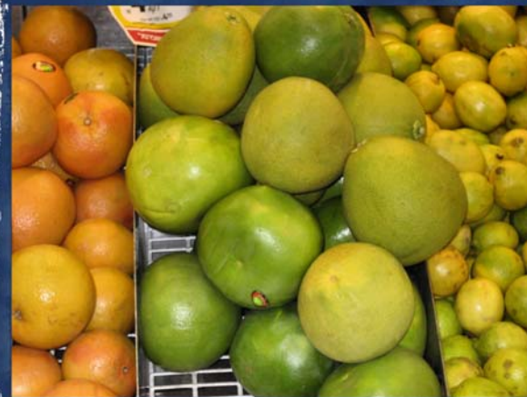
Some Polema fruit like what Eglon was cutting.