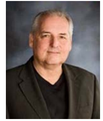
By Bill Salus

With the current crisis unfolding in Egypt, Bill Salus has written a very perceptive article on how this could very well be fulfilling the prophecy of Isaiah 19:1-4 where the prophet foretells great civil war and unrest in Egypt with the result that God will in judgment set a tyrannical leader over them. If Egypt goes the way of Iran, and all indications point in that direction, it will become another Islamic dictatorship who will threaten to attack Israel from the south. Bill's article shows how this scenario fits into the End-time situation prophesied in Scripture for Israel and their hostile Arab neighbors surrounding them.