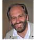
by Todd Baker