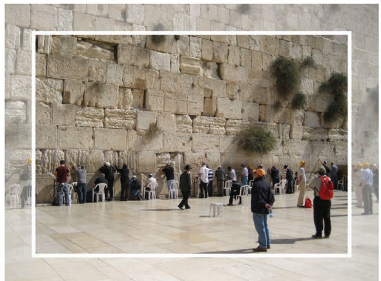
The Kotel (Western Wall) in Jerusalem