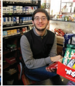
Joseph (Is 53 Explained book)