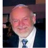
By Aviel B'Meir (Robin Hopper)

In the September/October 2013 issue of this newsletter, I posted an Article entitled The Light Is Dimming. The article can be read in that issue on this ministry's website. This article can be considered a continuation of that.